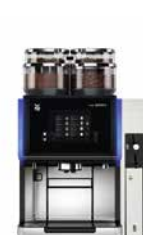
WMF 8000 S + coin checker, narrow