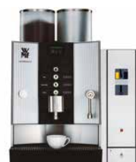
WMF combiNation F + coin checker, wide