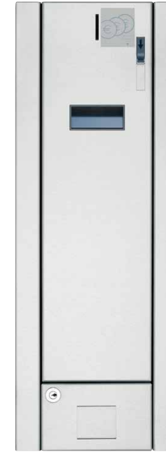
Coin changer, wide

Outer dimensions (width/height/depth): 170/604/496 mm