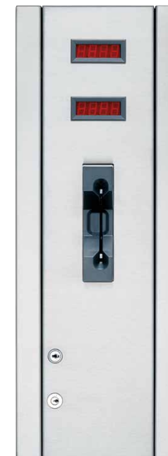
Card reader, wide (as shown in figure)

Outer dimensions (width/height/depth): 170/604/496 mm