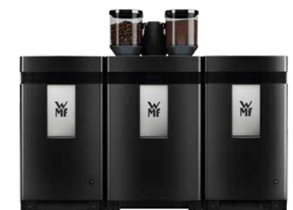
Cup&Cool, narrow + WMF 5000 S + Cup rack, narrow