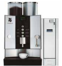
WMF combiNation F + coin changer, wide