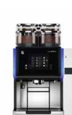
WMF 8000 S + card reader, narrow