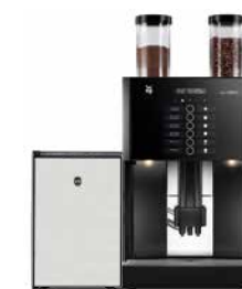
Countertop cooler + WMF 1200 S