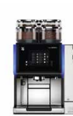
WMF 8000 S + coin changer, narrow