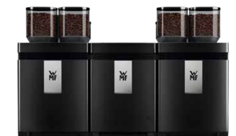
WMF 8000 S + Cup&Cool, wide + WMF 8000 S