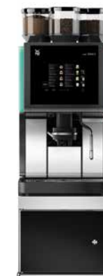
WMF 1500 S on under-machine cooler