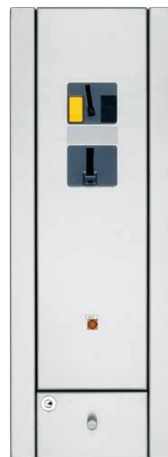
Coin checker, wide

WMF 1200 F, WMF 1200 S, WMF 1500 S, WMF 5000 S, WMF 8000 S