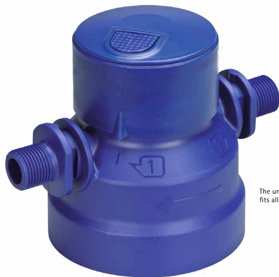
The universal filter head fits all filter cartridges

5-stage-filtration – long live the coffee machine.