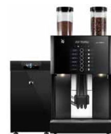
Countertop cooler + WMF 1200 S