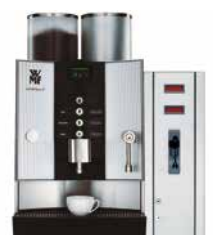
WMF combiNation F + card reader, wide