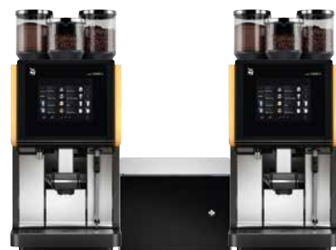
WMF 5000 S + countertop cooler + WMF 5000 S