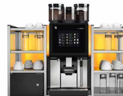
Cup&Cool, narrow + WMF 5000 S + Cup rack, narrow