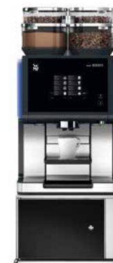
WMF 8000 S on under-counter cooler