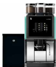
Countertop cooler + WMF 1500 S