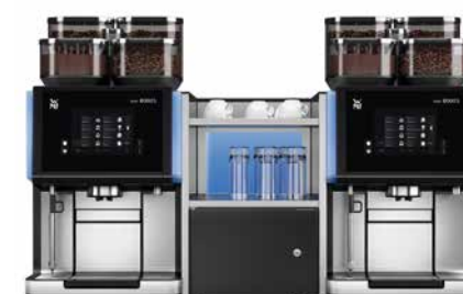
WMF 8000 S + Cup&Cool, wide + WMF 8000 S